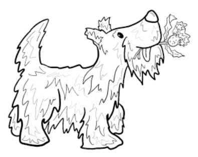
BOBBY, THE WESTIE