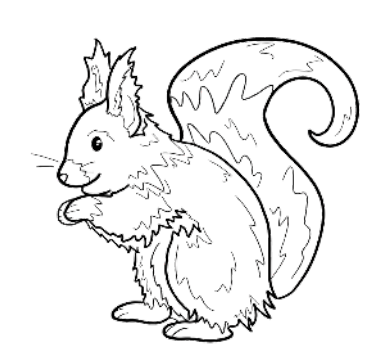
HAMISH, THE RED SQUIRREL