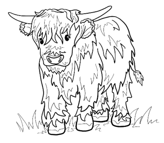
ALBA, THE HIGHLAND COO